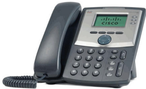
Cisco SPA 303 1 Line Entry Level $176 inc-GST