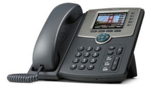
Cisco SPA 525G 5 lines Premium $440 inc-GST