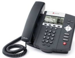
Polycom IP450 3 line Executive $374 inc-GST