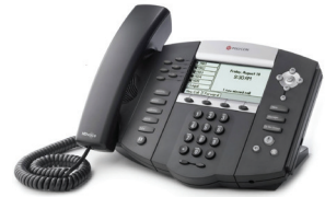
Polycom IP650 6 line Premium $525 inc-GST