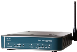
Cisco SRP527W ADSL2+ Modem, Router, 4 Port Switch, Wireless N, 3G Backup, Quality of Service. Automatic Configuration of Cisco Handsets $286 inc-GST