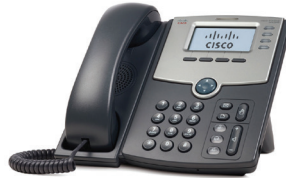
Cisco SPA 504G 4 Line General User $198 inc-GST