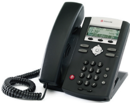
Polycom IP331 2 Line Entry / General $220 inc-GST